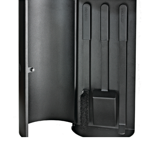
62917121 Morsø Complete Fire Tools