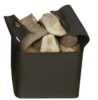
62920521 Morsø Firewood Box