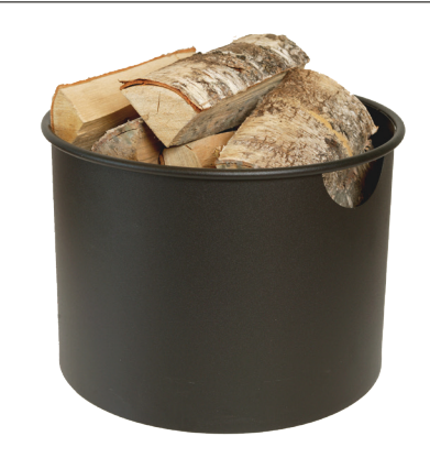
<sup>62900421</sup> Morsø Firewood Bucket 32 x 40 cm <sup>62920421</sup> Morsø Firewood Bucket 34 x 45 cm