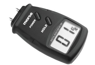
62929900 Morsø Moisture Meter