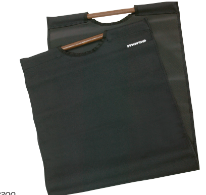
62912200 Morsø Canvas Wood Carrier

Right: 62900700 / Left: 62900800 Morsø Leather Glove left/right