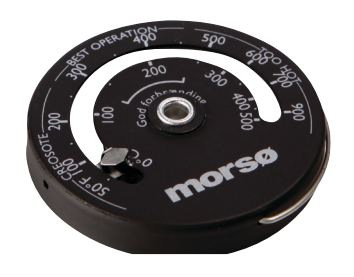
62901200 Morsø Flue Gas Thermometer