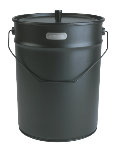
62905700 Morsø Ash & Storage Bucket

NEW 62993400 Morsø Adrian Firewood Basket