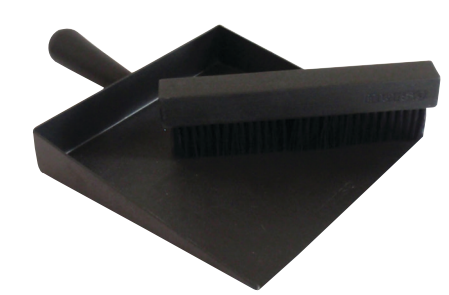
62917221 Morsø Dustpan & Broom