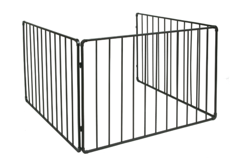
62906821 Morsø Child Guard 110 x 110 x 70 cm